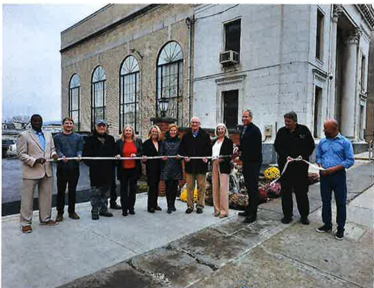
Ribbon cutting taking place at Burkey & Driscoll Home Furnishings

This annual event would not be possible without the numerous volunteers who plan the event, or who contribute their time to help the day of the festival. In 2023, 138 people volunteered and donated 1,375 recorded hours of time. As we continue planning for 2024 and future years, volunteers are critically needed. For those who love the event and want to see it continue, please consider giving a few hours of your time. Volunteer time slots are usually for two hours, but if you want to extend your time, you are welcome to! Some of the tasks include planning, setting up before the event, and clean up. Volunteers are also needed for help the day of the event with tasks like parking attendant, running an activity, manning a resource table, distributing event booklets and more. If you are interested in helping out, please email otfmanager@aol.com or call 610-562-3106.