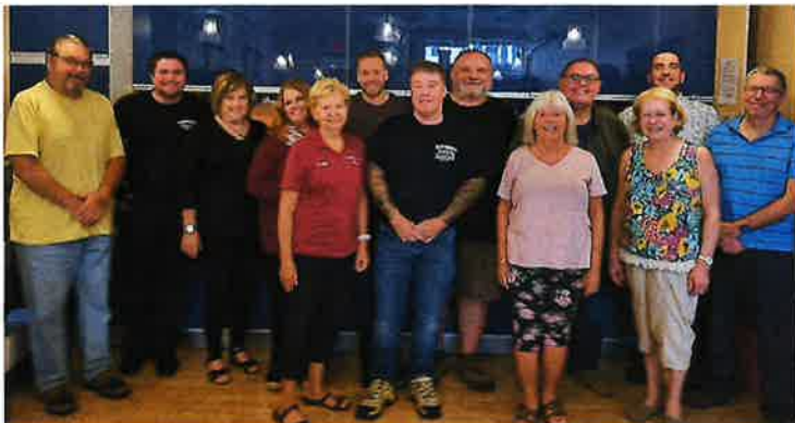
Current Board of Directors