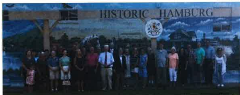
Press Conference attendees at State Street Square on August 26, 2021

Visit this link https://pasen.wistia.com/medias/089ixub2ve to see a video of the press conference.